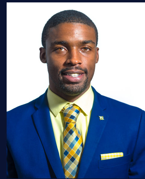
Minsiter Freedom National Spokesman